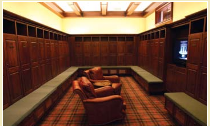
The Champions Locker Room is reserved for past PLAYERS champions.