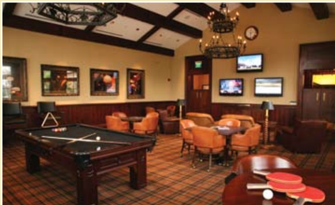
The Players' Lounge is a place for players to relax before and after rounds.

This is where the players chill out. Outside is where they become champions.