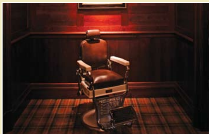
The barber chair was brought from Sawgrass Country Club years ago.