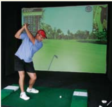
A fans tries to recreate a famous shot on the simulator for the 16th hole.

THE PLAYERS Stadium Village, an area where fans gather for an interactive experience, debuted in 2007 and is located in a more central location adjacent to the clubhouse this year, with a focus on the 16th, 17th and 18th holes. Fans can still attempt to hit the 17th green on a one-quarter-scale 17th hole at the UBS 17th Hole Challenge. In addition, fans can relive famous shots on the par-5 16th hole at a swing simulator and try some of THE PLAYERS' famous final putts on a replica of the 18th green. Finally, fans can have their photos taken with THE PLAYERS trophy that goes to the winner.