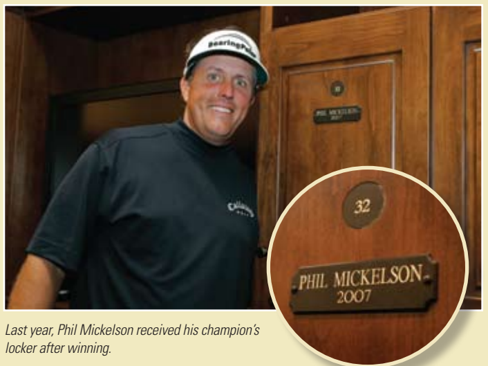
Last year, Phil Mickelson received his champion's locker after winning.