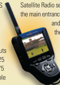
Stadium TV set

Complimentary all-day trials of Satellite Radio sets will be available at the main entrance behind No. 17 (P2) and near the entrance to the Stadium Village.