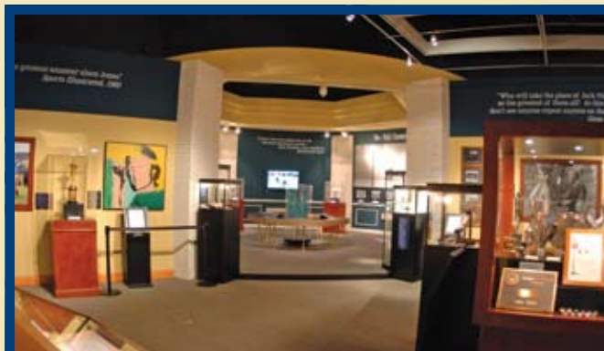
Many Nicklaus trophies and honors are on display at the World Golf Hall of Fame in St. Augustine.

Guests to THE PLAYERS can also get a taste of the World Golf Hall of Fame in the tournament's Welcome Pavilion, located near the