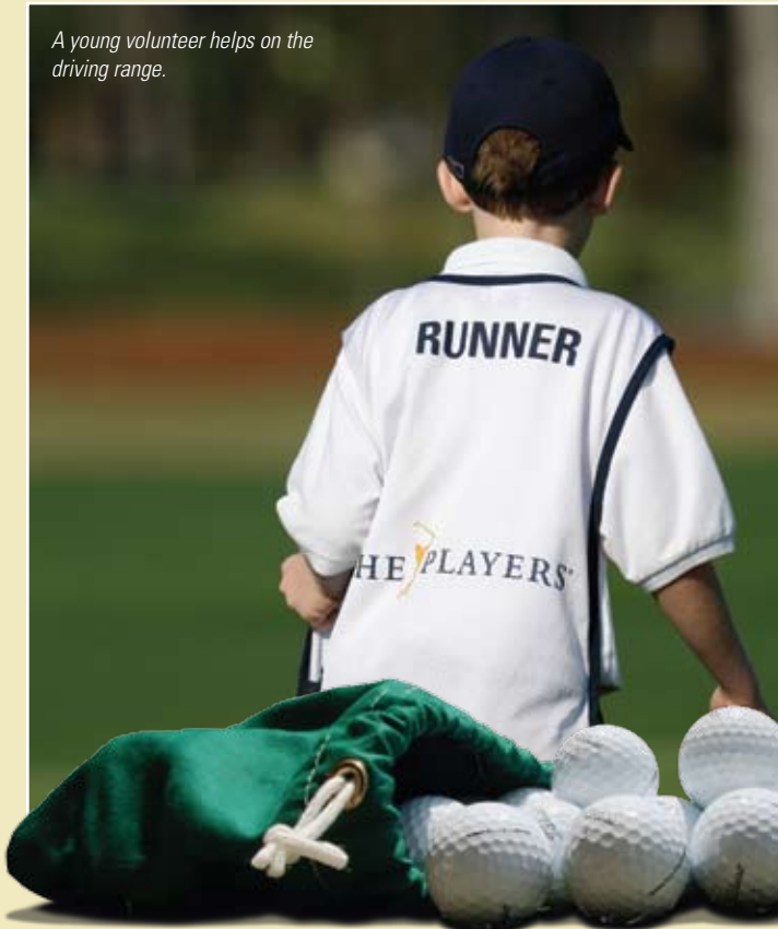
A young volunteer helps on the driving range.