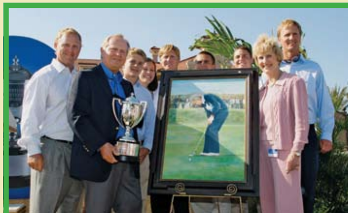
JACK HONORED Jack Nicklaus, flanked by his family, accepts the PGA TOUR Lifetime Achievement Award on Wednesday at TPC Sawgrass.

Guests to THE PLAYERS can also get a taste of the World Golf Hall of Fame in the tournament's Welcome Pavilion, located near the tournament entrance. The pavilion illustrates the